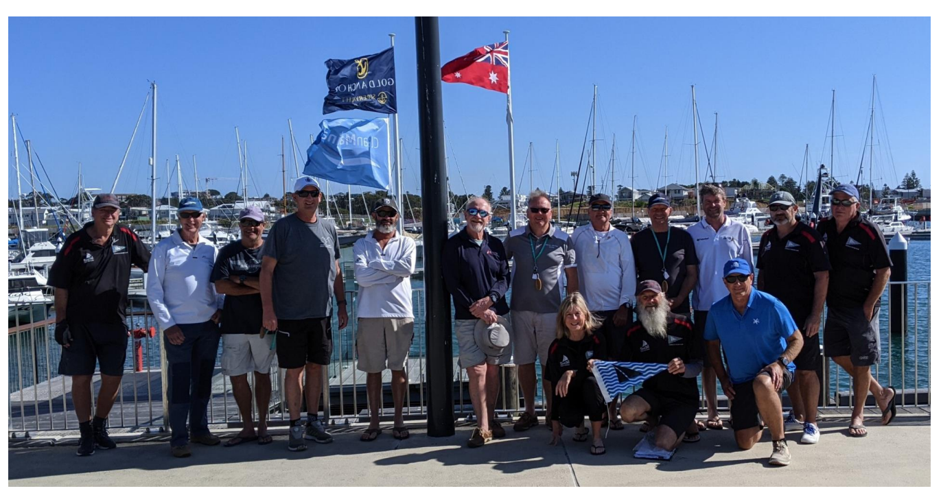
Skippers and crew at the Sunday morning briefing, Shellharbour marina.

Whilst the weather caused some challenges and changes to homecoming plans, the general consensus from skippers and crew was one of appreciation of this inaugural event and expression of strong interest in returning next year. Bring it on!